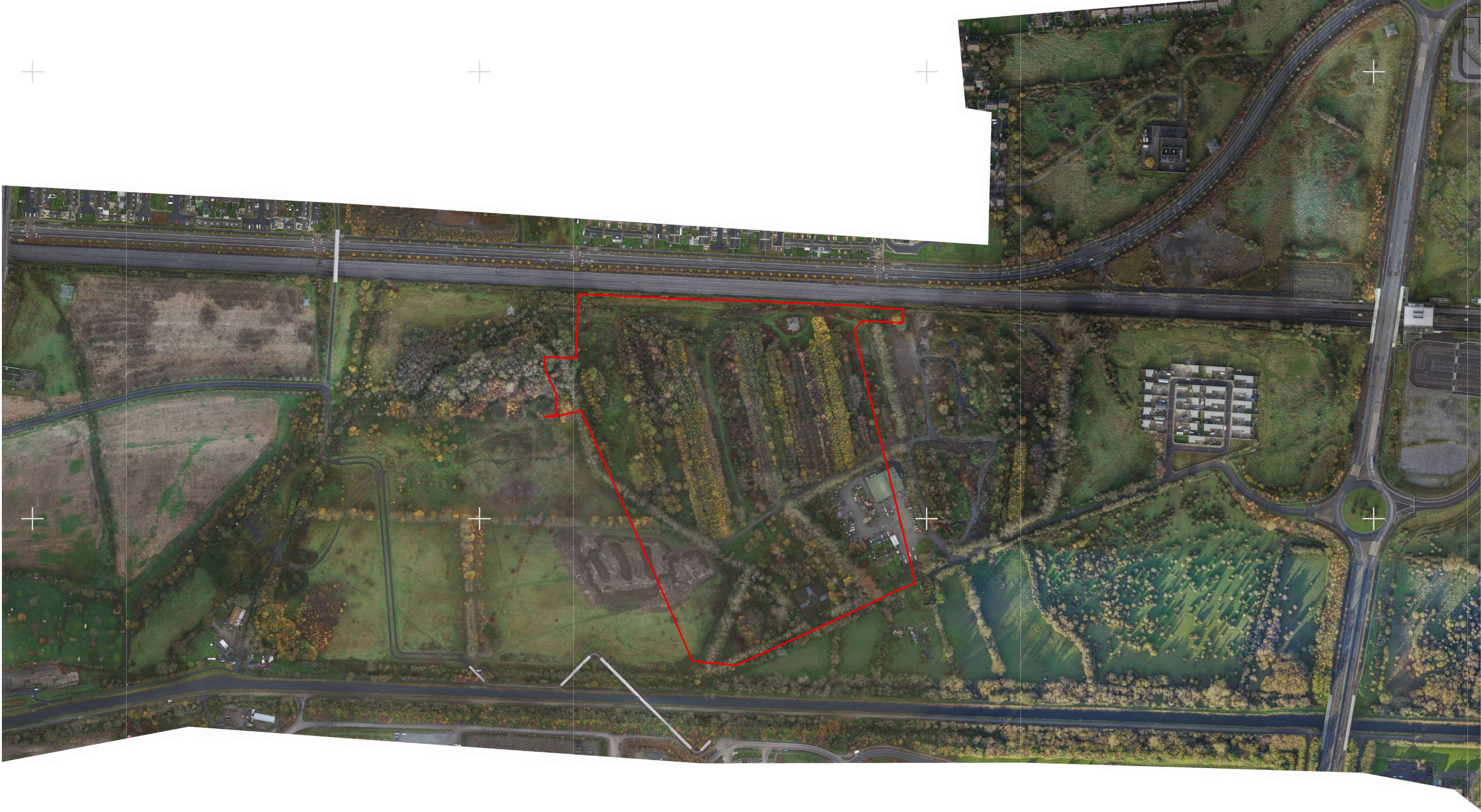
EXISTING SITE AERIAL MAP 1:2000 @ A1

GENERAL NOTES: DRAWING TO BE READ WITH REFERENCE TO THE FOLLOWING ASSOCIATED DRAWINGS AND INFORMATION: - 0000 SERIES DRAWINGS: EXISTING SITE INFO. - 4000 SERIES DRAWINGS: GA DRAWINGS/ UNIT TYPES INFO. - 1000 SERIES DRAWINGS: PROPOSED SITE LAYOUT INFO. - 5000 SERIES DRAWINGS: PROPOSED MATERIALITY - 2000 SERIES DRAWINGS: PROPOSED ELEVATIONS INFO. - 6000 SERIES DRAWINGS: HQA AND ASSOCIATED SCHEDULE OF INFO - 3000 SERIES DRAWINGS: PROPOSED SITE LONGITUDINAL SECTIONS - ARCHITECTURAL DESIGN STATEMENT